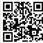
Luggage collection point map

You can bring your luggage to a luggage collection point near our hotel (3 minutes walk) and they will arrange luggage delivery for you to your next destination. Our hotel staff can assist you to create a delivery form for you to take to the collection point. If you need us to help you with filling out the delivery form, please let our hotel staff know.