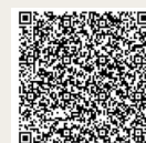
Route from Super Hotel to Kyoto Machiya Zeniyacho

Option 2: By Train (approx. 15 minutes @ 220 yen per person)