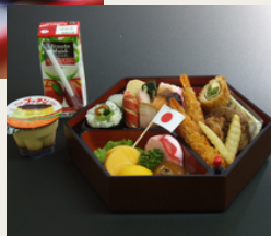
Japanese Kids Breakfast