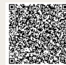
Route from Super Hotel to Kyoto Machiya Zeniyacho

Option 2: By Train (approx. 15 minutes @ 220 yen per person)