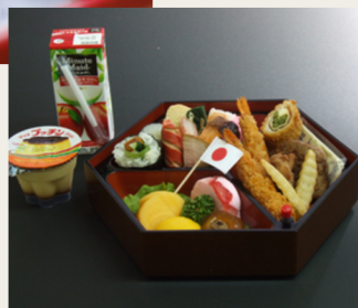
Japanese Kids Breakfast