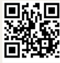
Family Mart (24 hours Operation)