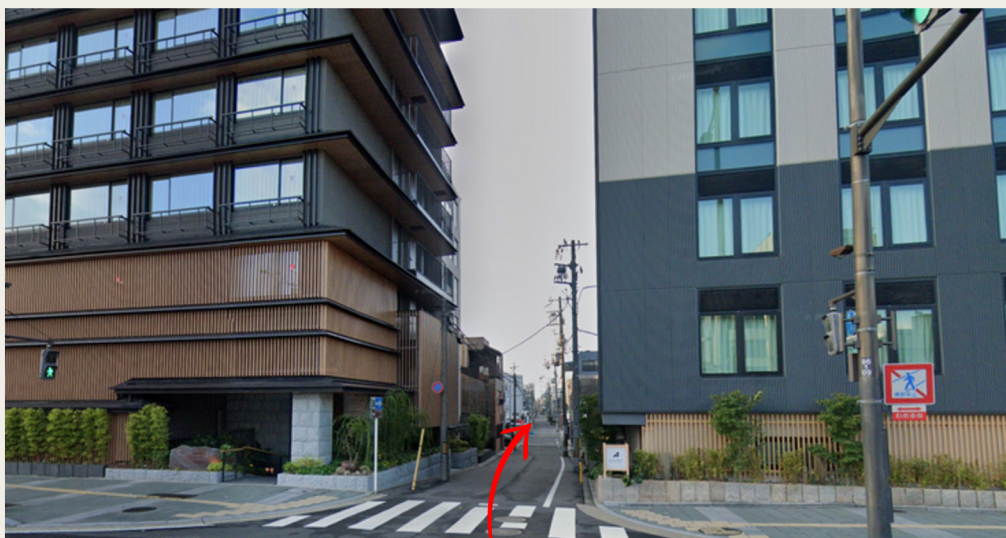
Double Tree Hotel