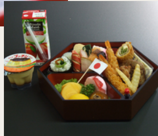
Japanese Kids Breakfast